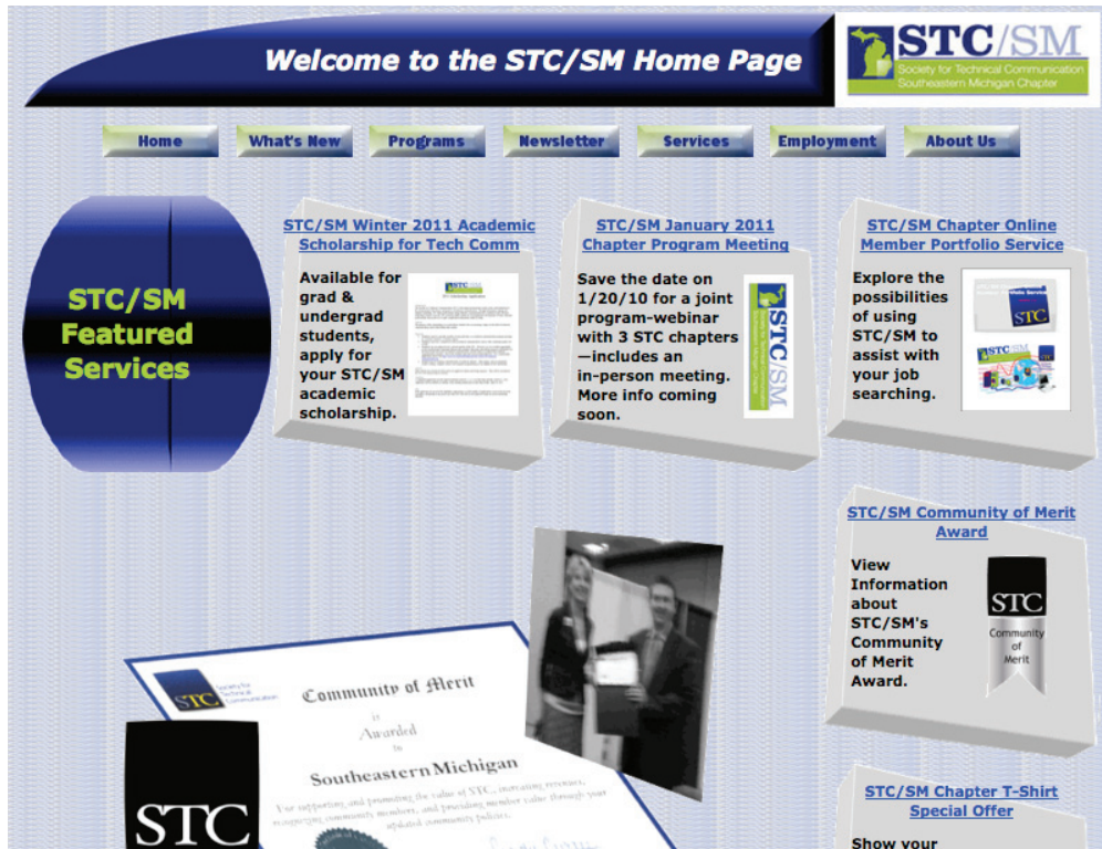
Figure 1: Home Page Top (1024 x 768 resolution, 17 inch monitor, window maximized)