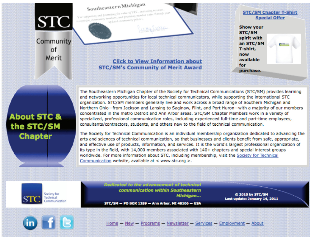
Figure 2: Home Page Bottom (1024 x 768 resolution, 17 inch monitor, window maximized)